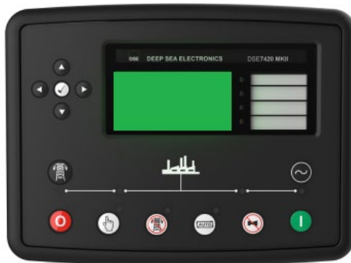
Deep Sea 7420MKII

The “7420MKII” controller is an auto start mains (utility) failure module for single gen-set applications. This controller includes a backlit LCD display which always displays the status of the engine and generator.